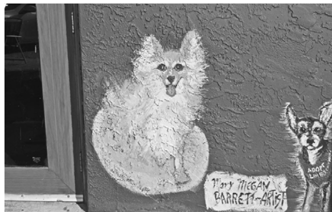
Personalized pet murals