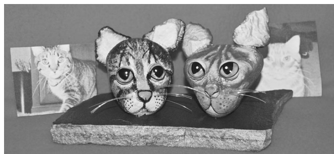
Personalized Wittywicks created from photographs