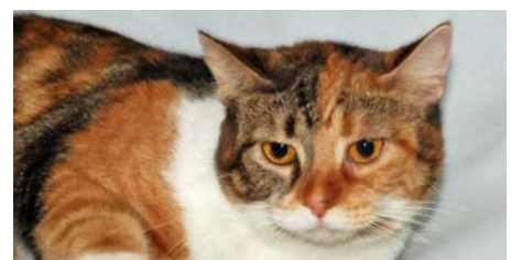
Reese - calicos have white fur, too